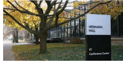
AWARDS SYMPOSIUM VENUE Hermann Hall, Illinois Institute of Technology, Chicago

The CTBUH Awards Symposium will be held in Hermann Hall, and the Ceremony/Dinner in Crown Hall, both at the Illinois Institute of Technology (see map right). Reach IIT's campus by: