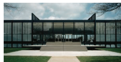
AWARDS CEREMONY & DINNER S.R. Crown Hall, Illinois Institute of Technology, Chicago